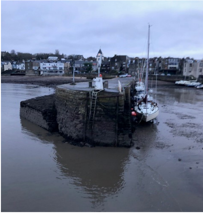
Figure 2 End of East Pier