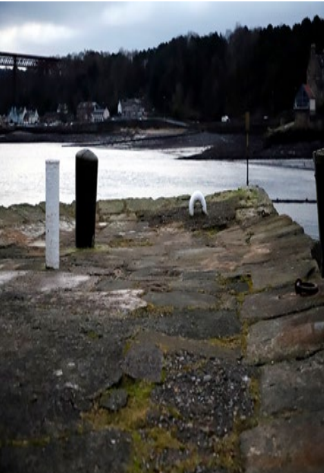
Figure 2 End of East Pier