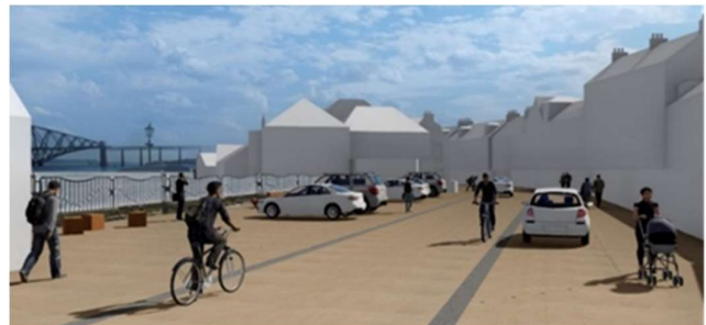
Visualisation of Core Area

The project will focus on resurfacing the main High Street in high quality materials, narrowing Newhalls Road leading up to the Hawes Car Park to create additional parking spaces, the construction of a new turning circle at the West end of the Hawes Car Park and the creation of a segregated cycleway along the front of the Hawes to encourage safe access for all.