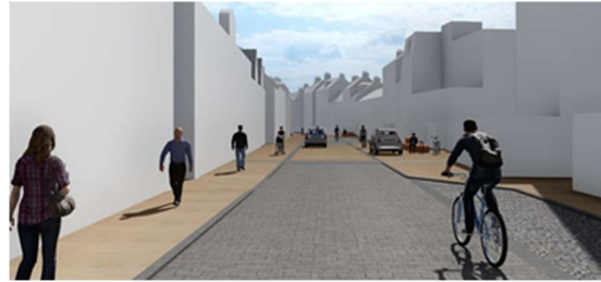
Visualisation of High Street looking East