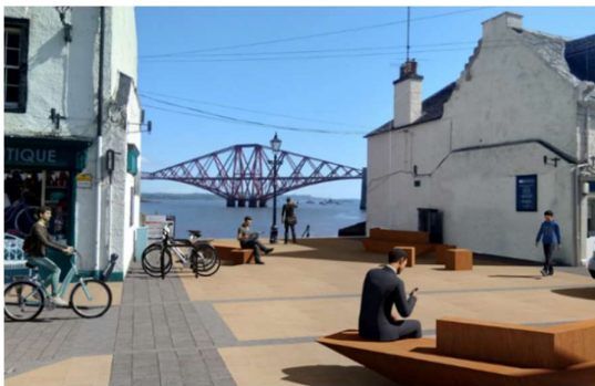
Visualisation at Boat House Steps

The project team will be supporting Stakeholder Liaison and Communications for the project in 2021 until completion.