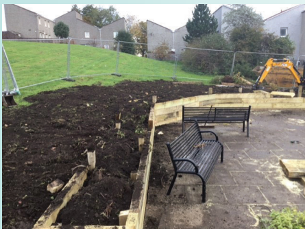
Ongoing works in Gateside