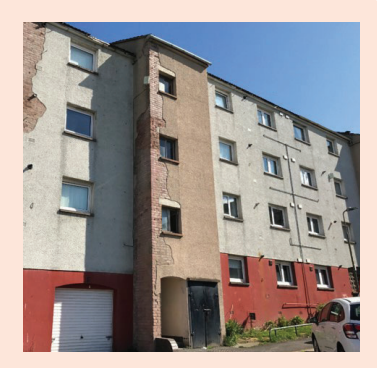
A visual for Western Villages as part of the new Granton Waterfront development